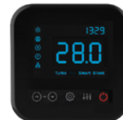
Wide LED touch screen