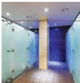
Internal Wall and Ceiling Panels