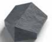
Edwardian hip end cap ERS 1325GY2-FG