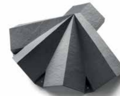
5-way ridge top cap ERS 1326GY2 (25°) Also available in: 15° (ERS 1334GY2) 20° (ERS 1335GY2) 30° (ERS 1336GY2) 35° (ERS 1337GY2)