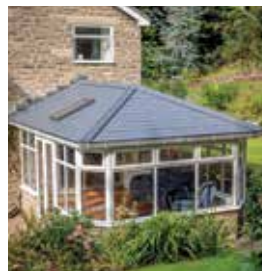
Equinox Tiled Roof System