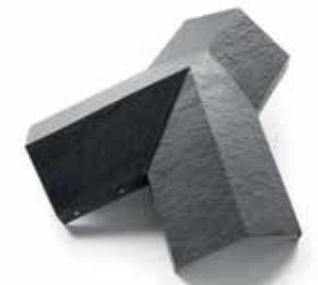
3-way ridge top cap ERS 1322GY2 (25°) Also available in: 15° (ERS 1330GY2) 20° (ERS 1331GY2) 30° (ERS 1332GY2) 35° (ERS 1333GY2)