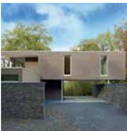
Twinson Premium Cladding