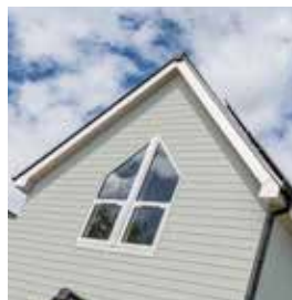
Coastline Lightweight Composite Cladding