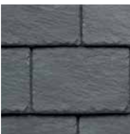
Slateskin GRP Sheet Tile System