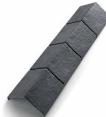
Ridge/hip length cap (6m) ERS 1321GY2-FG