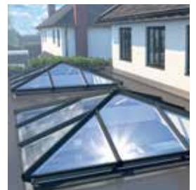
Skypod Lantern Roofs