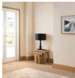
Roomline PVC-U Skirting