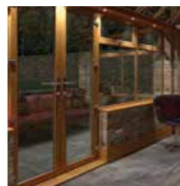
Deeplas Window Boards