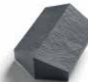
Victorian hip end cap ERS 1329GY2-FG