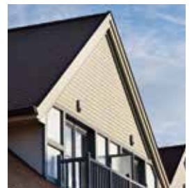
Deeplas Embossed Cladding