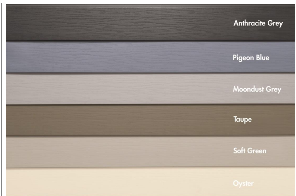
Figure 1 Available colours