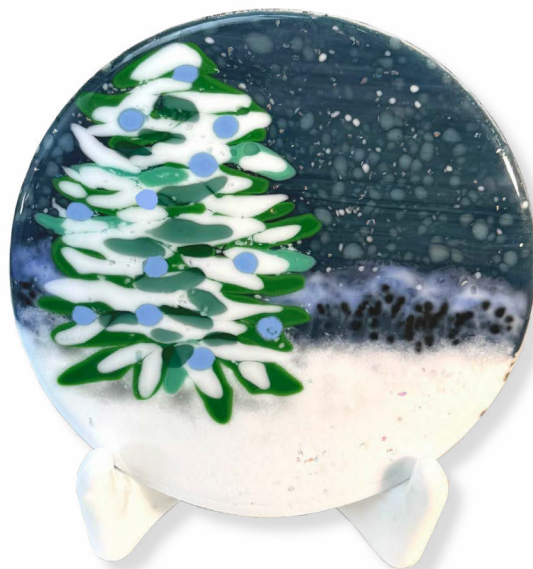
Plate featuring Hydrangea Rod dots on tree