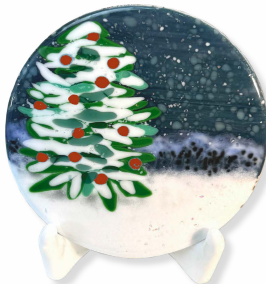
Plate featuring Red Opal Rod dots on tree for a holiday look — or try multi-colored dots!