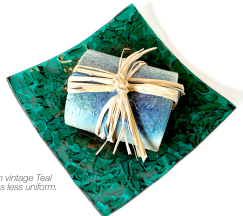
Soap Dish made with vintage Teal Uroboros Frit that was less uniform.