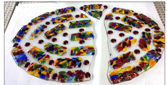
Example of Thick-Thin Design stress

A design that varies significantly in thickness — such as the example shown at right — is a likely candidate for breakage. The piece was designed as a way to have young kids engage in creating a fused glass project. Each child made one of the rectangles consisting of colored glass on a Clear Base (2-layers thick). These were then arranged on a single-layer Clear Base. Stress resulted when the thin areas in the Base contracted while the thick areas of the children's designs were spreading. The net result is that the glass was moving in different directions simultaneously creating enough stress to cause it to break. The most stable designs are those that have approximately the same amount of glass evenly distributed on two or more layers.