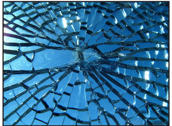
Think you're stressed? With enough stress, glass will eventually break.

Oceanside Compatible™ is our family of glass products specifically formulated for fusing compatibility. Every glass and accessory carrying the brand can be trusted to fit together harmoniously, free from compatibility stress. Do not mix non-Oceanside Compatible glass with Oceanside Compatible glass in the same project. Breakage will result.